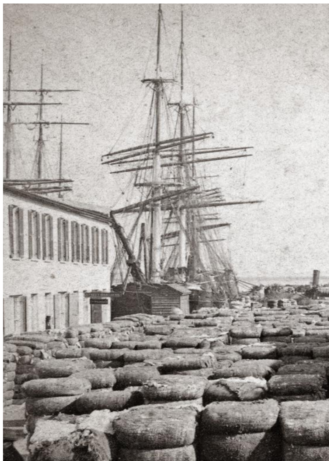
Staging Cotton Bales on N. Adgers Wharf 1885

The Nicholson Wealth Management Group leverages decades of knowledge and applies a disciplined investment management approach with each client to help craft a custom-tailored strategy.