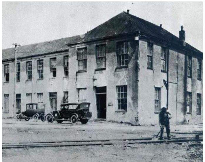
N. Adgers Wharf 1924 With A Lincoln Phaeton and Ford Model T Center Door

Talk with us about our wealth management services. Working together, we can develop a strategy and present customized strategies using our client-first philosophy and resources to help you work toward your financial objectives.