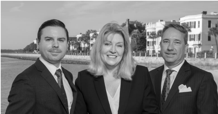
The Nicholson Wealth Management Group

Guiding Principle Two are better than one because they have a good return for their work Ecclesiastes 4:9